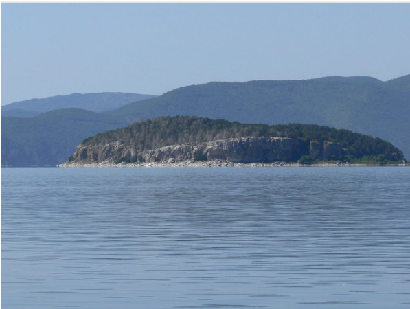
Figure 3. Golem Grad Island, a part of Galichitsa Mt.

The first reports for the spider fauna of Galichitsa Mt. came from Drensky (1929), Drensky (1936) and Stojićević (1929). This information was summarized later by Drensky (1936), who reported 83 species. Additional data can be found again in the papers of Šilhavý (1944), Nikolić and Polenec (1981), Deeleman-Reinhold and Deeleman (1988), Deltšev et al. (2000), Lazarov (2004), Wunderlich (1973) and Wunderlich (1985). All these data are summarized by Blagoev (2002). The aim of this study is to present a review of the spider fauna of Galichitsa Mt. due to critical incorporation of available literature data and unpublished faunistic records carried out by sporadic research in the last 10 years.