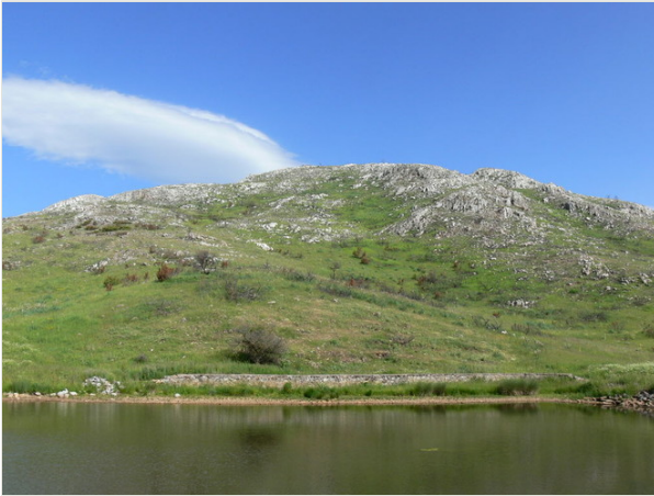
Figure 6. Sampling site at Dzhafa pool.