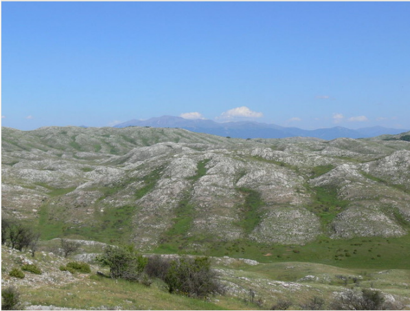
Figure 2. Galichitsa Mt, karst forms.