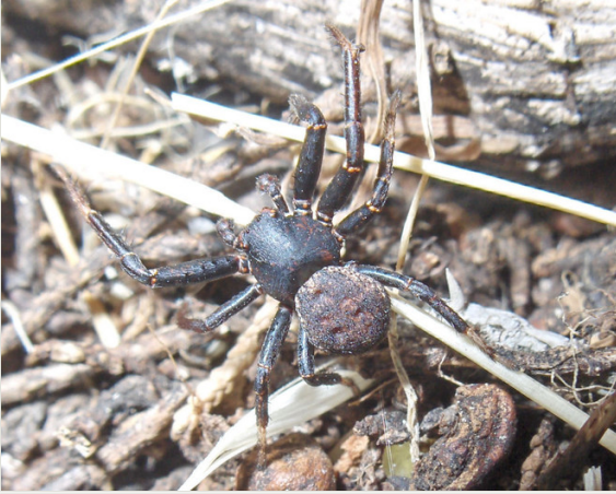
Figure 9. Xysticus tenebrosus , typical for the Golem Grad Island.