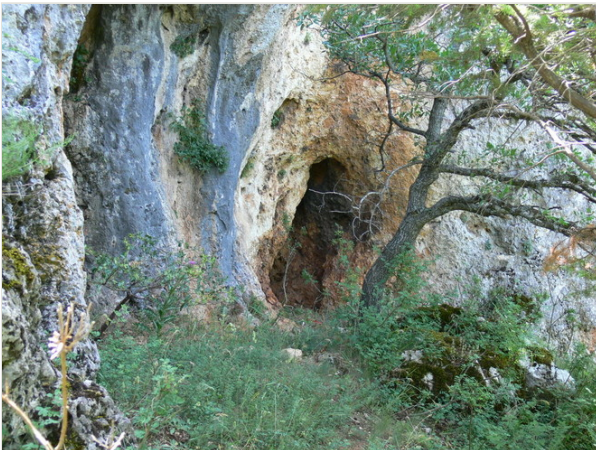
Figure 7. Sampling site at Leskovska Pestera Cave.